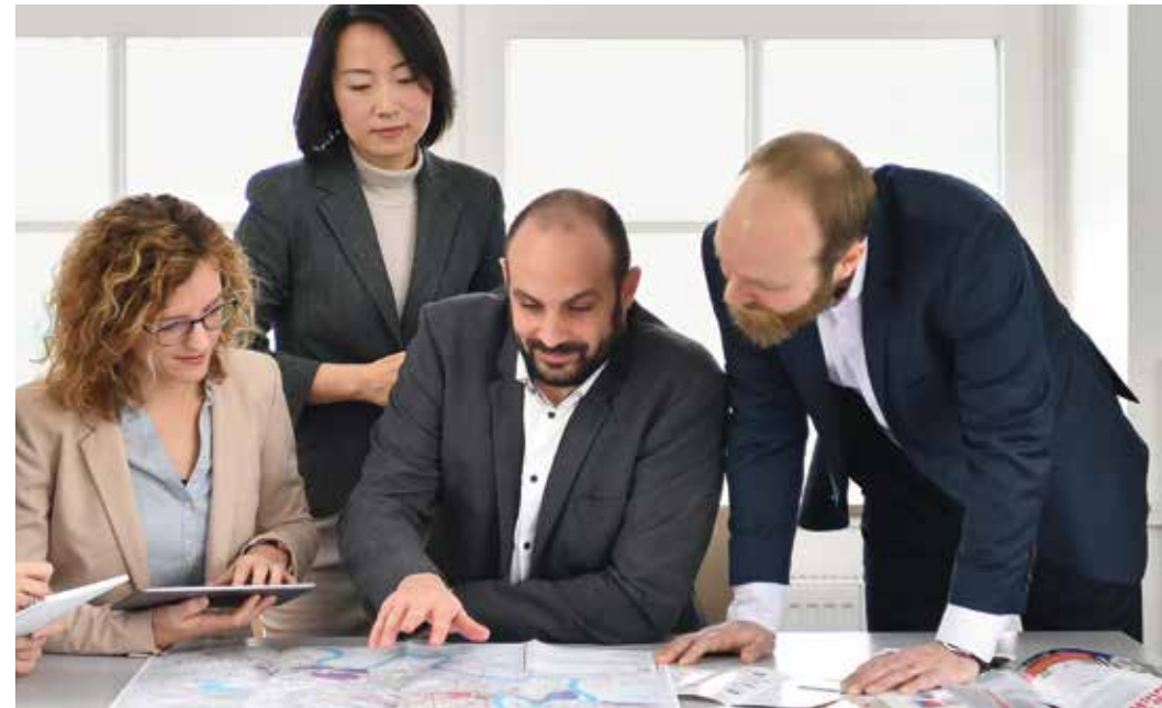
→ Office of Economic Development | The team supports startups, medium-sized companies and international corporates

In Düsseldorf, all of the pieces fit together perfectly – looking for space, hiring qualified employees, joining important business networks