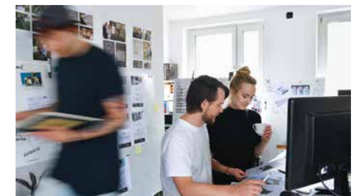
→ Co-working spaces | Creative work environments for startups

Trivago was once a small startup in Düsseldorf – and showed its confidence in the city's economic strength by building its new company headquarters for around 2,000 employees in the bustling MedienHafen. Global cosmetics market leader L'Oréal moved its German headquarters to Düsseldorf in 1991. Completed in 2018, the newly constructed headquarters is a highly visible landmark that exudes transparency, innovation and sustainability. Around 1,000 employees work at Huawei Technologies' European headquarters, focusing on important research and development projects with the city's network operators.