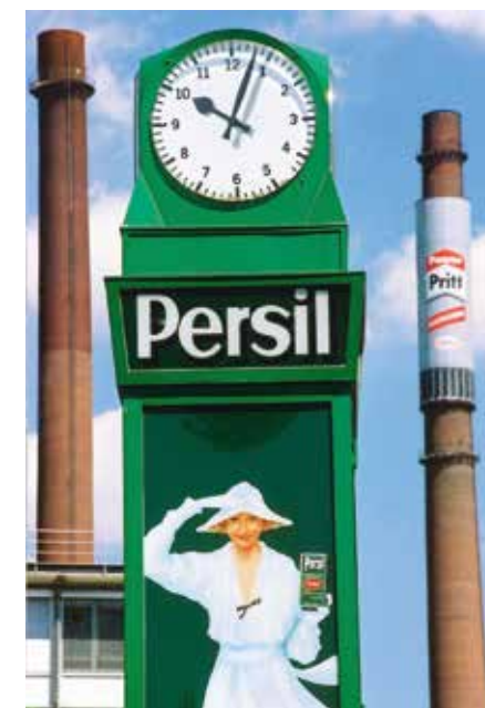
→ Henkel | Düsseldorf company with a long tradition, yet still drives innovation

Innovation from tradition. Where else can a steel corporation be transformed into a telecommunications giant? Or a laundry detergent producer into the world's largest glue manufacturer? Here, startups emerge to become major global enterprises – and the long-time “office of the industrial Ruhr” is quickly becoming the “lab of the future”. Düsseldorf has always understood the need for structural change, and has driven this transformation over the past several decades. The region's long-standing industry and production players work closely with the city's extensive service sector, which thrives from its proximity to so many customers. In turn, industry benefits from the valuable momentum that comes from the area's many innovative and tech-oriented providers. In Düsseldorf, innovation and creativity are the keys to the evolution of this competitive international hub – and its future success.