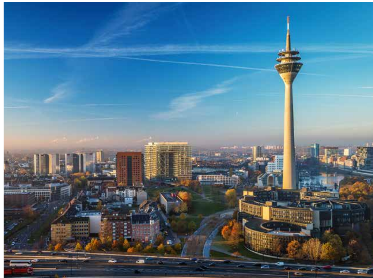
→ Düsseldorf real estate market | Something for practically every need

In Düsseldorf, all of the pieces fit together perfectly – looking for space, hiring qualified employees, joining important business networks