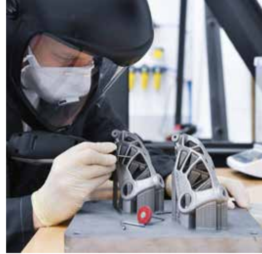
→ Material research | Visionary technologies made in Düsseldorf

Universities and companies collaborate on digital innovations at the "Innovation hub for digital media solutions" ("Innovationshub für digitale Medienlösungen") – a framework for generating ideas, developing and implementing concepts, and bringing the resulting innovative solutions to the digital economy. Creative and technological minds meet to explore new, ingenious opportunities for everyone involved. "Digitale Stadt Düsseldorf e.V." is a group of around 300 members that also invites people to join in their regular networking meetings.