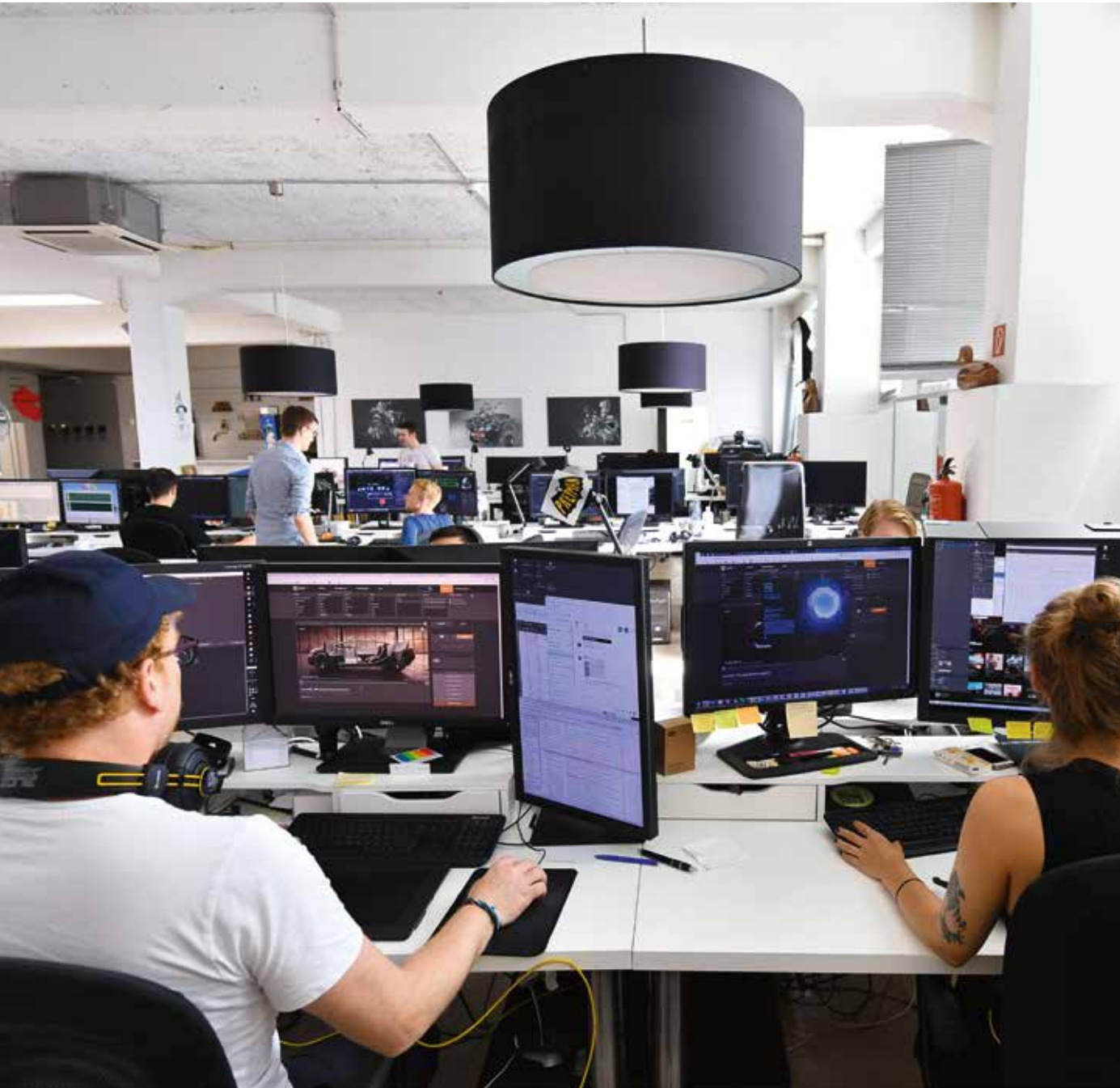
→ Innovation hub | Universities and companies collaborate on digital innovations

Düsseldorf's strength is its ability to embrace change early on – and put it to good use. Progress and innovation are integral parts of this city.