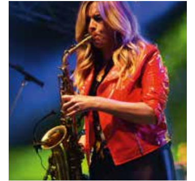
→ Jazz rally | Top acts and good times

Whether you like barbecuing on the beach on the Rhine or eating a Kobe steak at an exclusive restaurant, Düsseldorf has something for everyone to enjoy – with their friends and colleagues. Some say that you should "never mix business and pleasure". That's not Düsseldorf. Here, everyone should enjoy what the city has to offer – whether on or off the job.