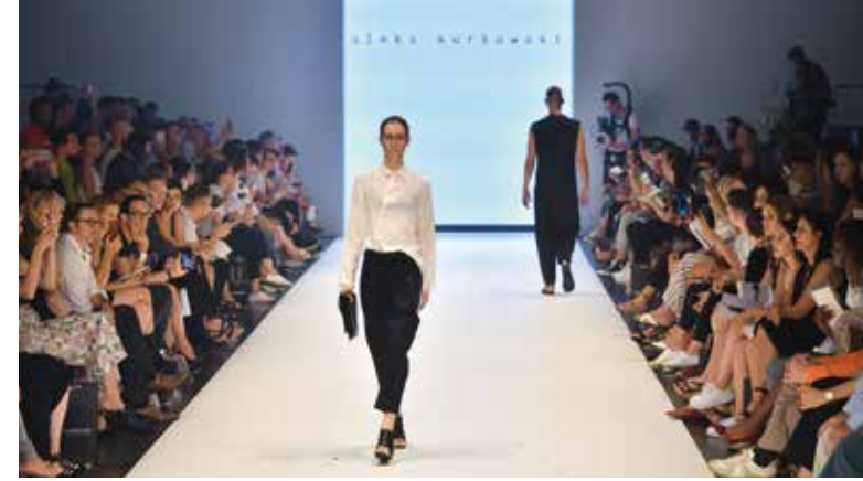
→ Fashion | Highest sales in Germany