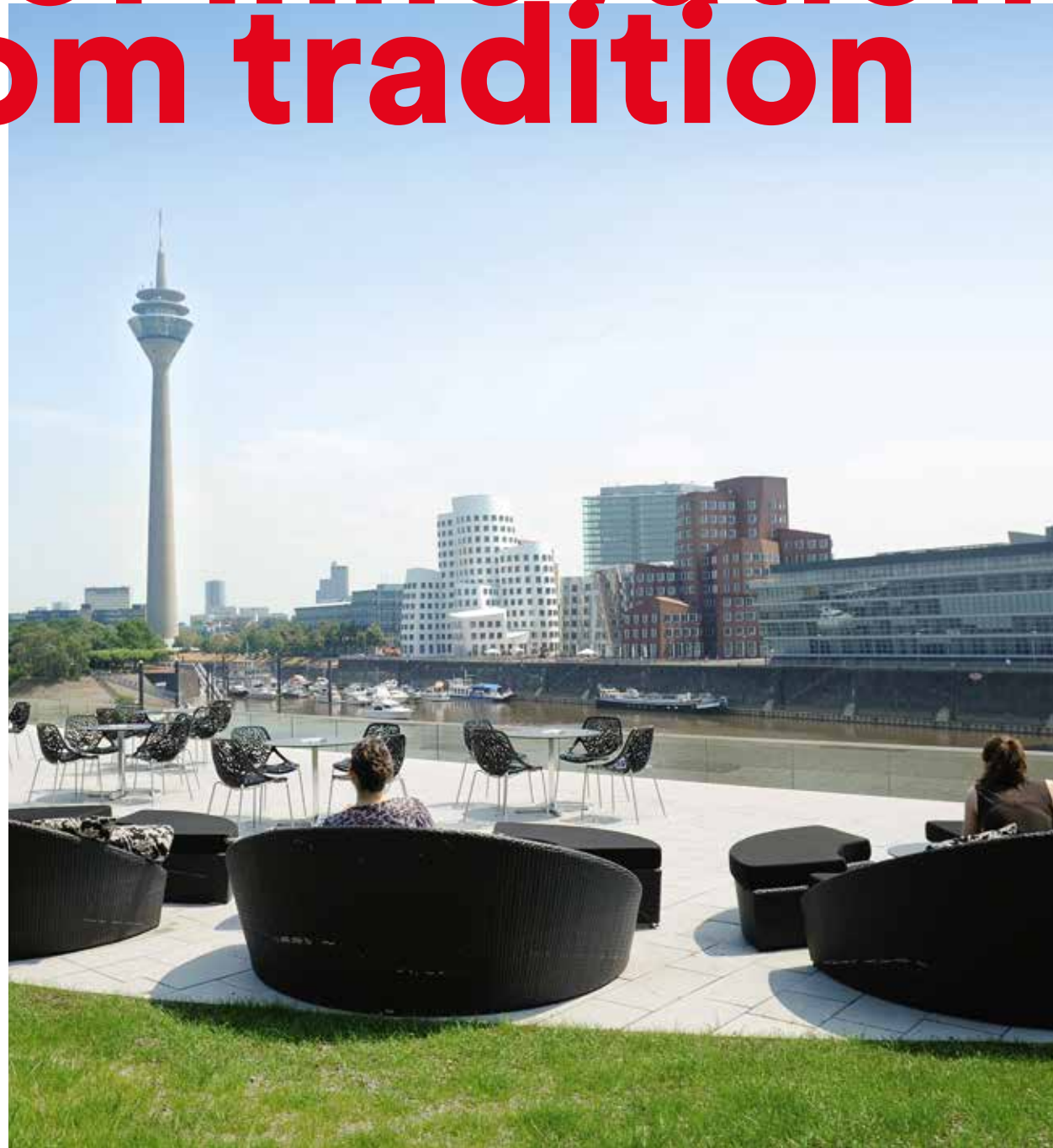
→ MedienHafen | A former commercial port became an exclusive office location