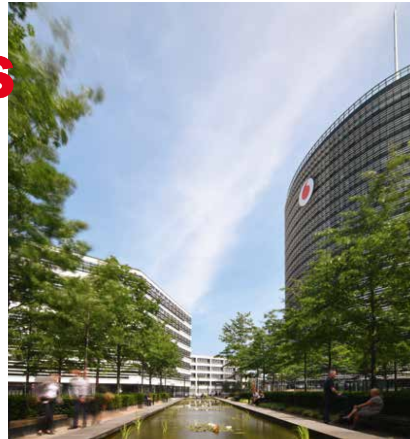
→ Vodafone Campus | Hotspot for collaboration and communication