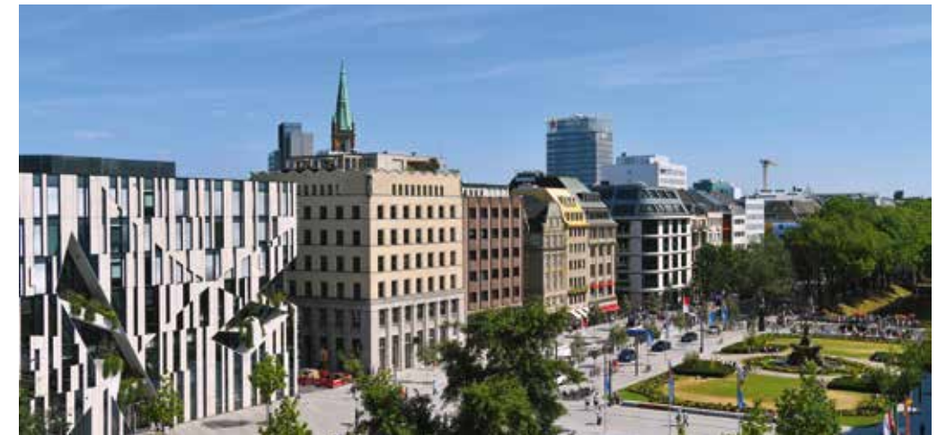
→ Königsallee | One of Europe's most exclusive shopping streets

Live close Feel free. People from Düsseldorf love to connect with each other and the rest of the world. The city of short distances is home to residents from over 180 countries – a place that brings people from around the world together. Marking the meeting point of the Düssel and Rhine Rivers, Düsseldorf is a cosmopolitan, urban place unlike any other.