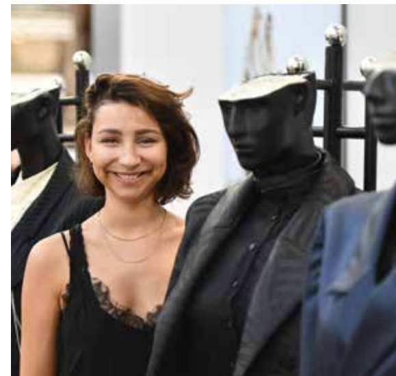
→ Fashion | Düsseldorf fashion schools train new creative talents

Live close Feel free – bringing creatives and entrepreneurs together. Major innovative companies, like Vodafone, Henkel, Ergo and Ceconomy, all operate in Düsseldorf and are open to partnerships and collaborations. Vodafone has its Vodafone Innovation Park in Düsseldorf, while Vallourec, Voestalpine, Renesas and NEC have located their research and development facilities to the city. The 3 largest mobile telecommunications providers – Vodafone, Telekom and Telefónica – are all represented here, along with the most important network equipment makers, like Huawei, ZTE, Nokia and Oracle. Large companies like Deloitte Digital, SMS digital and Grohe established their digital units in Düsseldorf for good reason: it is a technology and service hub that promotes talent and innovation.