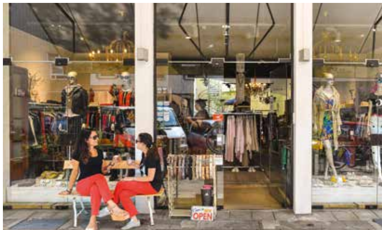
→ Flingern | Shopping beyond the Kö