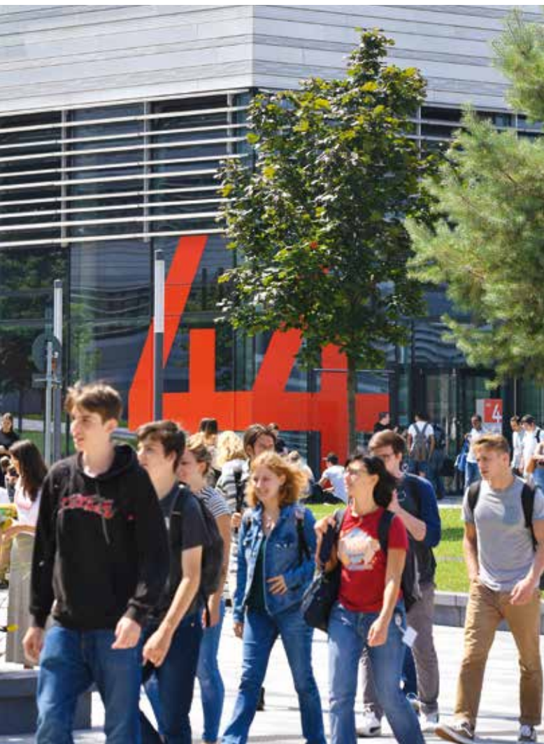
→ University of Applied Sciences Düsseldorf (HSD) | Practice-based research and instruction

Companies can always find the experts and specialists they need in Düsseldorf. After all, the state capital is very popular among talents in the region.