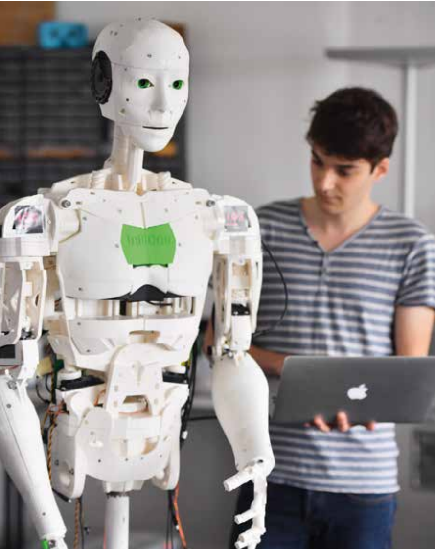
→ IOX LAB | The first humanoid robot completely made by 3-D printer

Düsseldorf is where agility, ingenuity and the startup spirit meet market experience, expertise, capital and a strong customer base.