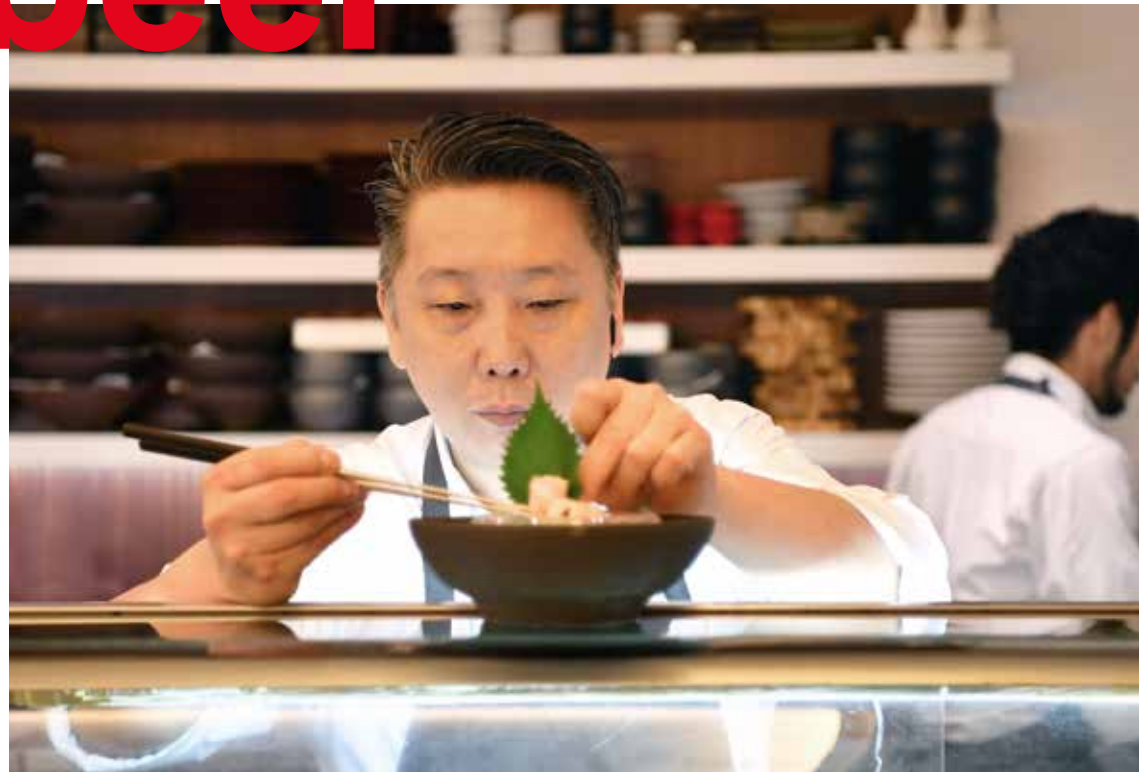
→ Cuisine | International top chefs serve their best in Düsseldorf