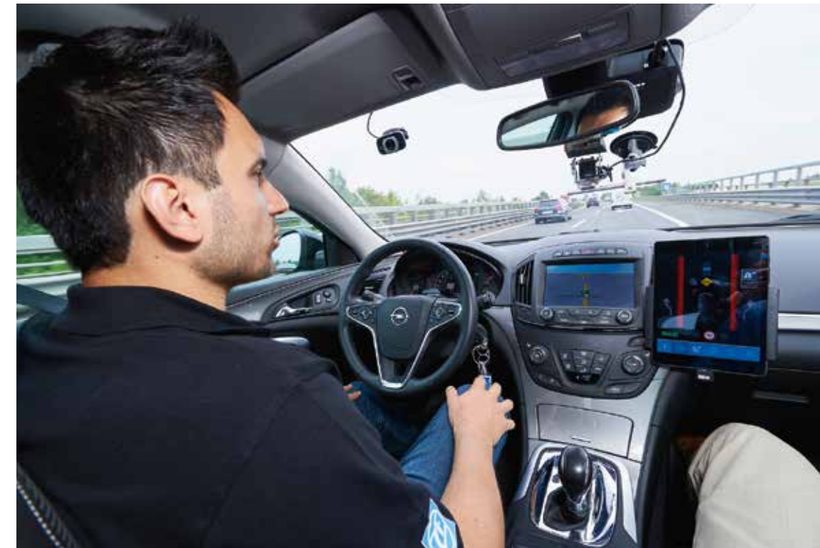
→ Mobility of the future | Testing grounds for self-driving and networked vehicles

The Office of Economic Development supports startups every step of the way – from testing initial ideas, financing, finding locations and networking with established companies to entering international markets. At the Innovation Manager Meeting, for example, people can discuss solutions to the issues involved in getting a business running. A mentoring program also brings experienced company representatives and startups together.